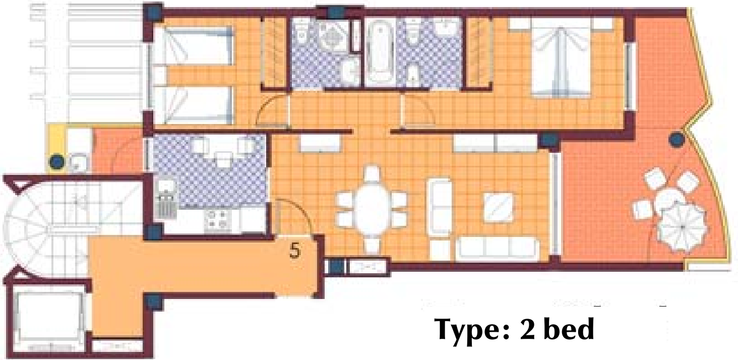
Type: 2 bed